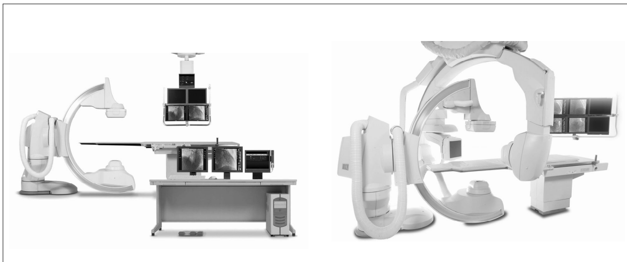
Photo:Single-lane C-arm system MH-300 (with 9" FPD) and Bi-plane C-arm system MH-300/MH-400, DAR-9400f digital angiography system, X-ray generator console and KS-70 catheterization table.(The components for CCC area is different from the photo)