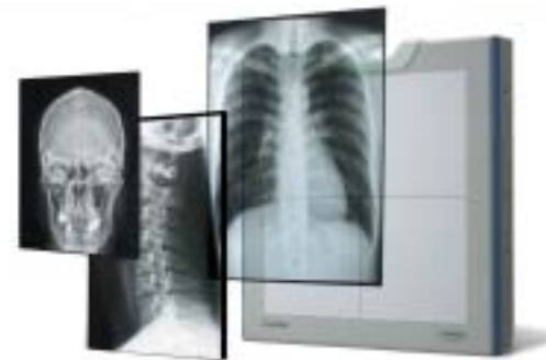
Automatic sizing of X-ray images up to 17 x 17 in. (43 x 43 cm).

Thanks to a large imaging area of 17 x 17 in. (43 x 43 cm), the CXDI-40EG lets you capture desired anatomical views for both large and small format X-rays in portrait or landscape orientation—without having to rotate the detector unit. From examinations of the skull, spine, chest, abdomen, to the extremities, the generous size of the detector accommodates a wide variety of exams.